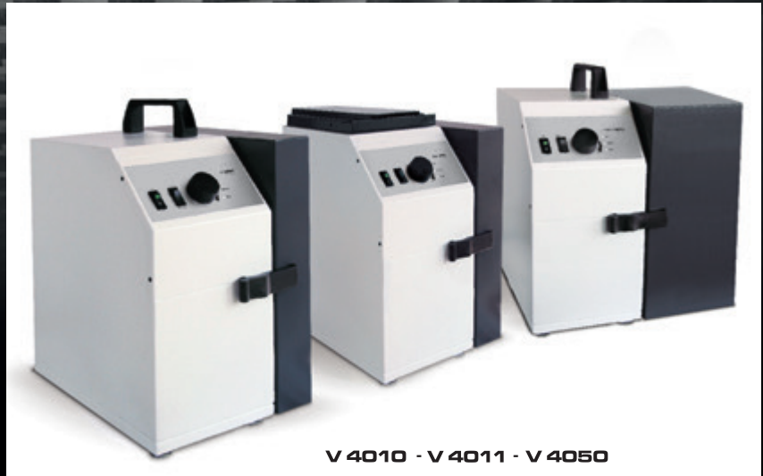
V 4010 - V 4011 - V 4050